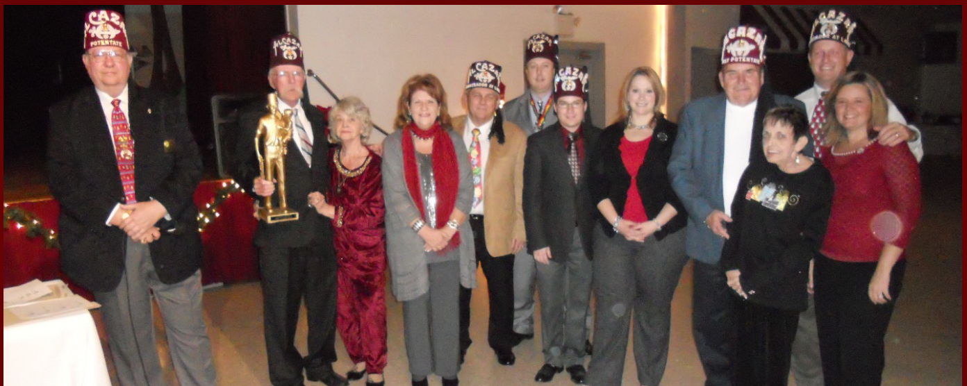
Alcazar Shrine Camel Riders - 2011 Unit of the Year