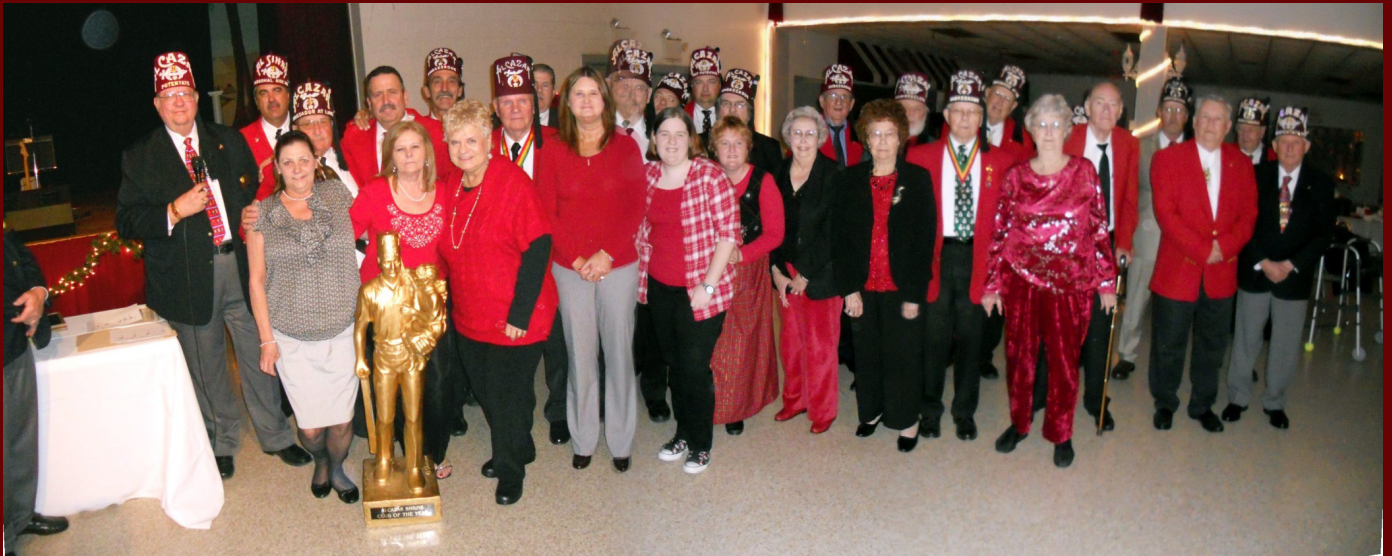
Alcazar Shrine Phoenix City Shrine Club - 2011 Club of the Year