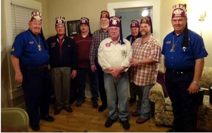
Geneva Shrine Club