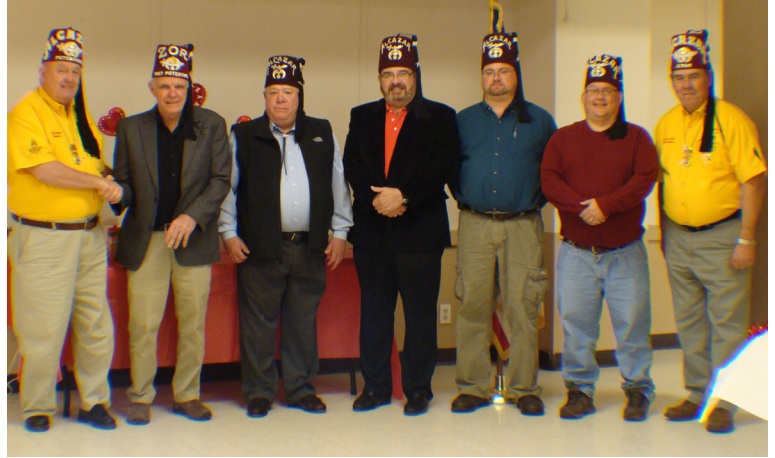
Troy Shrine Club