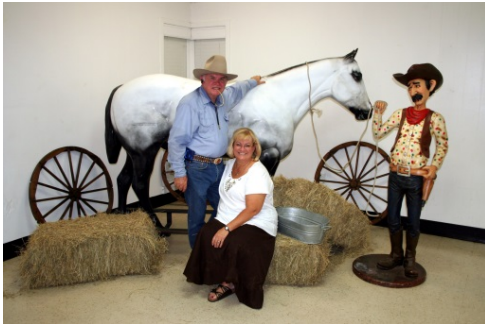
Cowboy & Cowgirl!