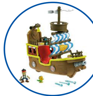
Musical Pirate Ship