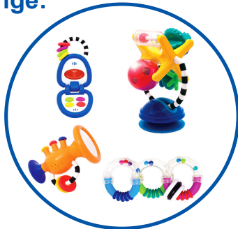
Sassy Gift Set