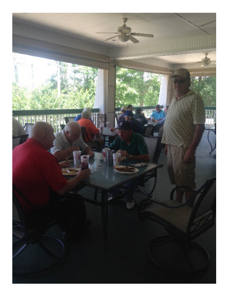
It was great to have the golfing nobles to play and all others who played.